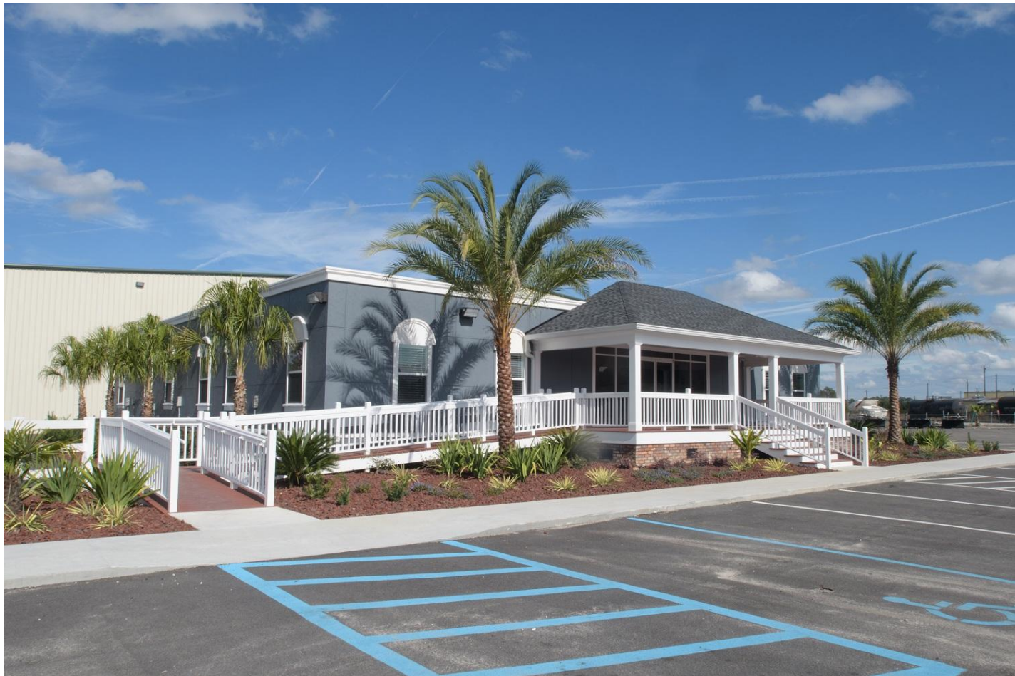
Photo: Carolina Skiff Model from Vanguard Modulares