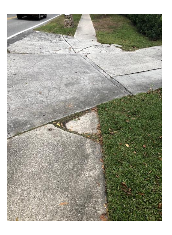
Sections of Existing Sidewalk on Florida Blvd between Camellia Terrace and Fifth St