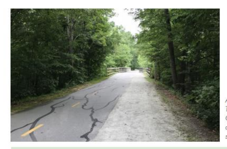
A portion of the American Tobacco Trail in Wake County, N.C., features an asphalt trail with stone-dust shoulder alongside it.

The aim generally is for a 12-foot wide pathway but that may not always be achieved initially. In more rural areas, where use may be lower, a narrower width may suffice. All new trails are expected to be designed and built according to best practices. The East Coast Greenway Alliance follows AASHTO standards for shared-use paths: